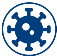
Reduction of viruses