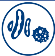
Reduction of bacteria